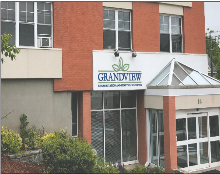
Grandview Rehabilitation and Healthcare Center Located at 55 Grant St. in New Britain, the Grandview Rehabilitation and Healthcare Center helps residents continue leading a meaningful life.

Through its long-term care program for those who require the security of 24/7 supervision, daily activities from Bingo to religious services stimulate the residents' need for social interaction, mental and physical stimulation. They also provide dietary needs, nursing and physician services and medication management.