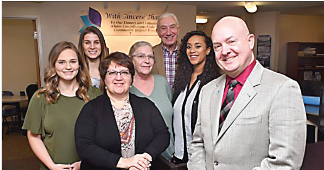
Community Foundation of Greater New Britain

As one of the oldest community foundations in the nation, the