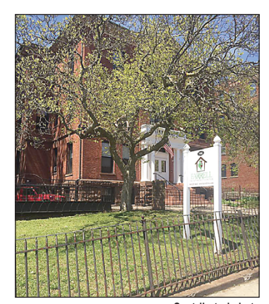
The Farrell Treatment Center in New Britain

With a focus on the individual person, Farrell Treatment Center, located on 586 Main St., provides a recovery-oriented system of care and