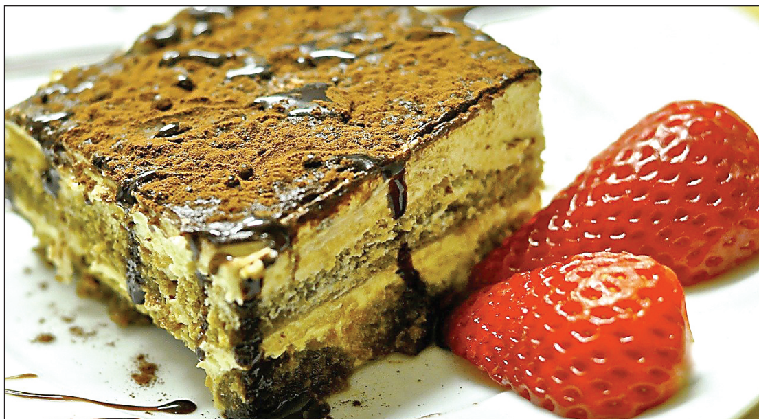
One of the many desserts Portofino's offers at its Italian restaurant.