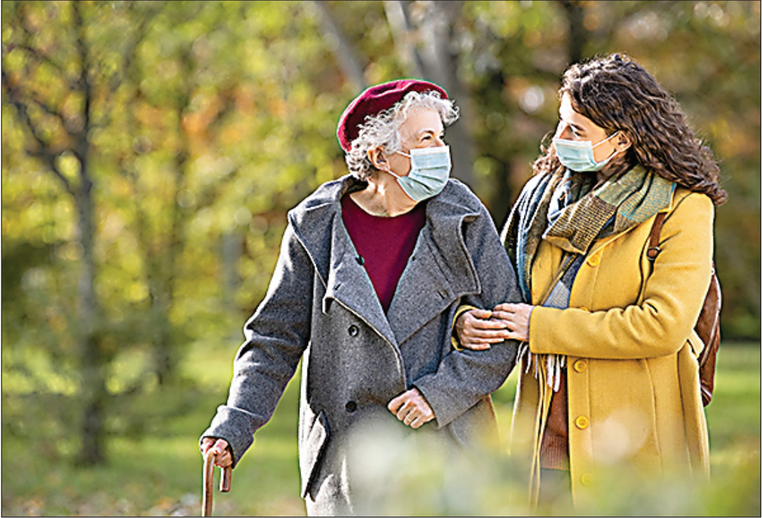
A client walks with a caregiver from Visiting Angels Newington.

vices in the local areas, ranging from meal preparation and medication reminders to respite care and specialized care for seniors who need a bit more help on a daily basis. They also offer hourly care, overnight care, and 24-hour care in their service locations. At its Newington location, the agency said they strive to make sure that the clients and their families are comfortable with every care decision that they make at every stage of the process. “As a licensed and bonded agency, each of our caregivers in Newington are chosen based on their prior experience in senior home care, their attention to detail, and their empathetic approach to supporting others,” the agency said. “We select your loved one’s caregiver based on who we think is ideally equipped to deliver their care plan.” No two families are exactly alike, which is why Visiting Angels Newington developed a series of Life Care Navigation senior care programs which includes many options to meet a wide range of needs, including companion care, personal care, a ready-set-go home program that provides post-hospitalization care, social care, and non-