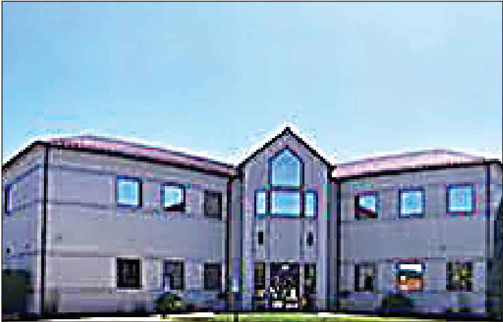
UBI, A Community Federal Credit Union, headquarters in Plainville.

UBI's website states the company still prefers customers use the drive-thru service lanes, "which in turn provides optimum